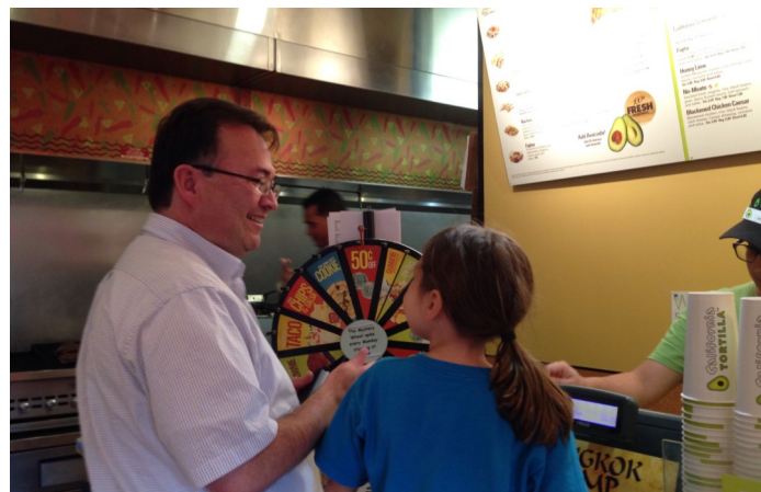
Supporting the band at California Tortilla